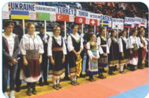
World Championships 2015 Belgrade Opening ceremony