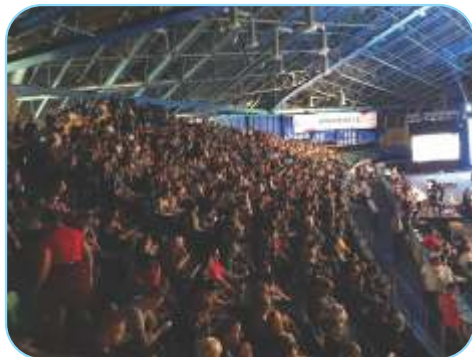
WAKO kickboxing at The World Games final night: Orbita hall full of audience

Our concepts show quality and attract media as well as audience whether it is World Championships, professional fight nights or at finals during World Games 2017.