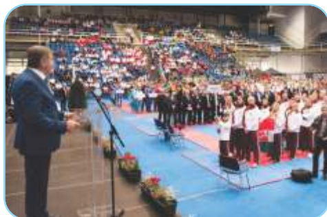
World Championships 2017 Budapest Opening ceremony