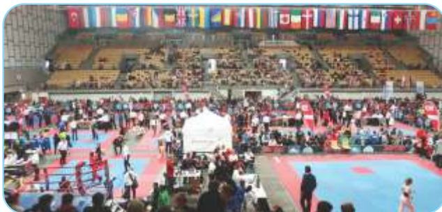
Austrian Classic World Cup 2016