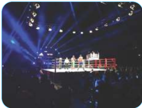
World Championships in Belgrade 2015, 10.000 spectators at Final night