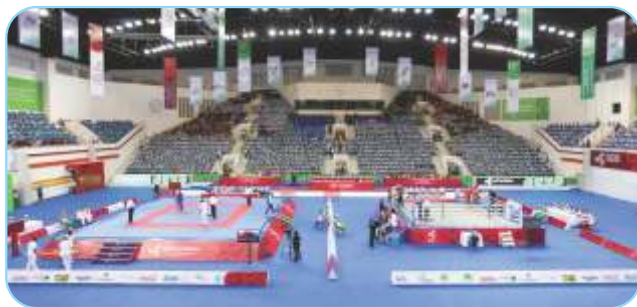
WAKO ASIA Championships 2017