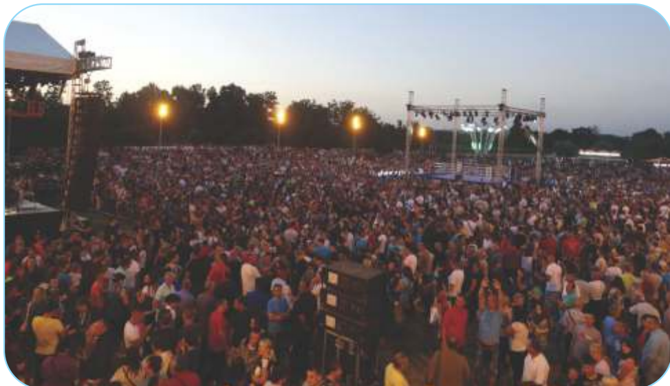
Serbia vs. USA Kickboxing match, town Jagodina, Serbia 2016, 12.000 spectators at open space