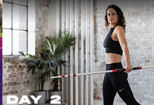
WEAPONS CHLOE BRUCE (GREAT BRITAIN)