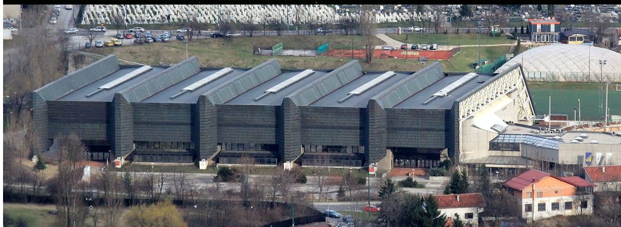
Olympic Complex Zetra is the biggest sport-recreative complex in Sarajevo.