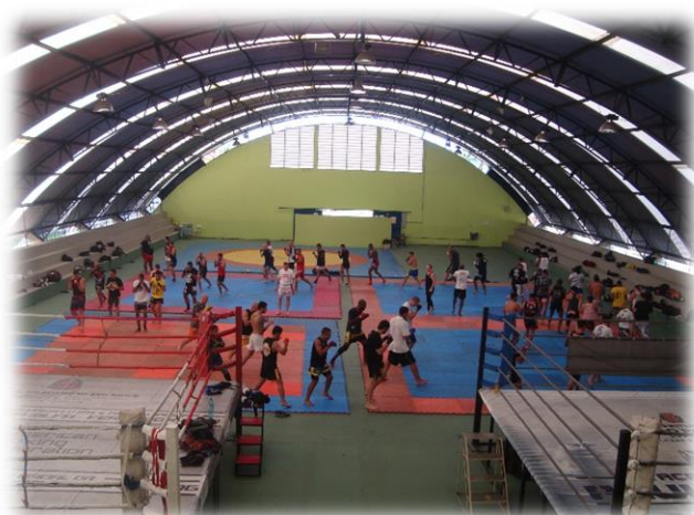
Panam Training Center, Piracicaba, Brazil.

WAKO Panam has been highlighted not only for organizing competitive events, but also for holding several events to capacitate our referees and athletes. We are proud to state that we are the only Continental Confederation that have two Training Centers in partnership with local government, being one of them located inside the facilities of the Training Center of the Paraguayan Olympic Committee, which brings to WAKO a positive status.