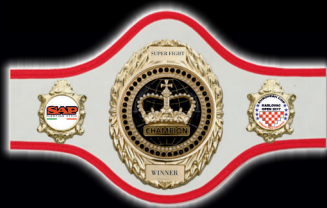
WINNER BELT SUPER FIGHT

17.000,00 € VALUE INCLUDING BELTS, CUPS, UNIQUE MEDALS, AND SPORTS EQUIPMENT