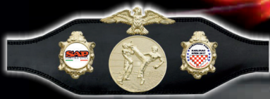
EUROPEAN CUP WINNER BELT