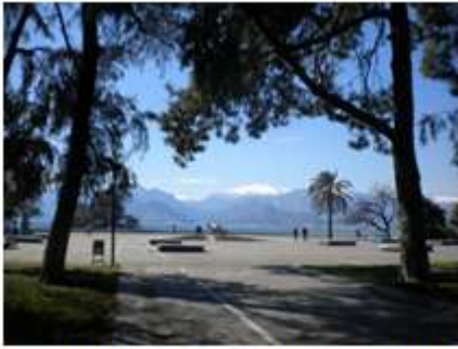
Karaalioglu Park and the Taurus Mountains

While that might be a bit of biased hyperbole, there is no doubt that Antalya has some stunning views. The marina surrounded by dramatic cliffs and ancient city walls, the beach with the Taurus Mountains in the background, and the charming old city of Kaleici all make Antalya a photographer’s dream.