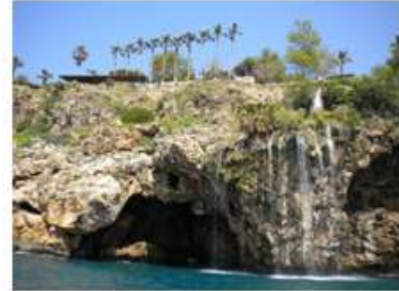
On a boatride from Kaleici

The most beautiful part of Antalya is Kaleici’s harbor, and the best way to spend a day is to take a boat trip from here. You’ll get to see Antalya’s coastline, swim in pristine coves, and eat freshly caught and grilled fish.