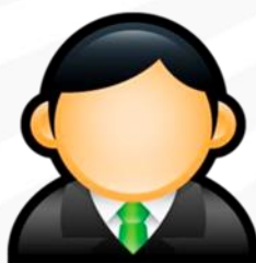
WAKO NATIONAL REPRESENTATIVE